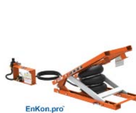
With 12169 16997