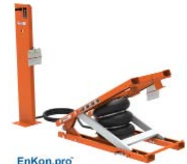
With 12522 16997