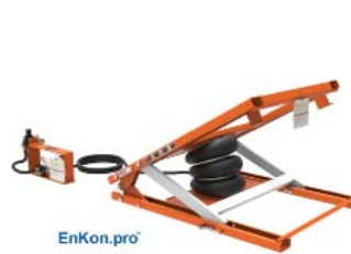
With 12169 16997