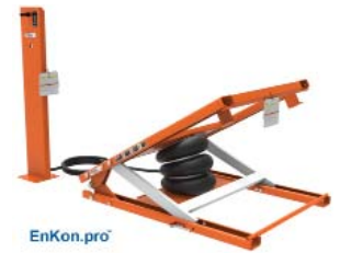
With 12522 16997