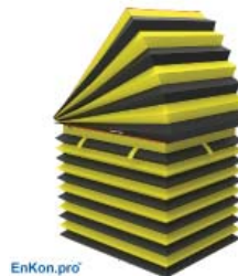
With 1007952 - Qty 2