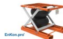
EnKon.pro™ With 13768