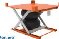
EnKon.pro™ With 16529