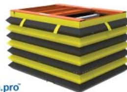
EnKon.pro™ With 1007951