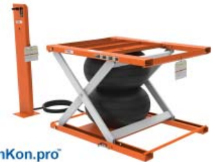
EnKon.pro™ With 12522