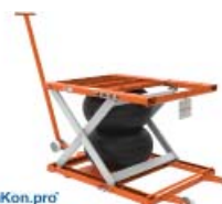
EnKon.pro™ With 13761