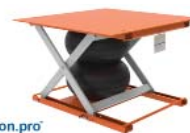
EnKon.pro™ With 13427