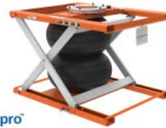
EnKon.pro™ With 13689