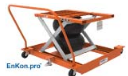
EnKon.pro™ With 13760