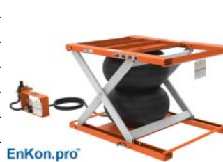
EnKon.pro™ With 12169 16997