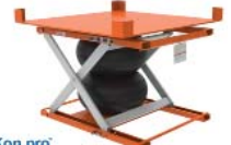
EnKon.pro™ With 16526